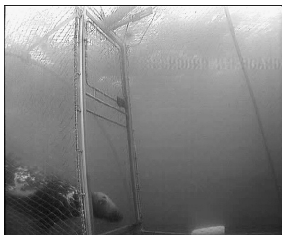
Fig. 2. An adult grey seal is approaching through the open non-return gate into the middle chamber; from here the seal swims towards the entrance of the fish chamber.

The first gate-device tested was a simple one-way ‘cat door’ design that was constructed of a hinged frame with a thin vertical wire in the middle. Fish could swim undisturbed through the door into the final chamber of the trap (fish chamber). It was assumed that a seal could lift the door and swim towards the fish chamber where it would be trapped. However, this did not happen. Seals did not open the door; instead, they tried to swim through it and thereby became stuck between the wire and frame. A second ‘door’ version had a lowered frame. Seals quickly learned to open it and