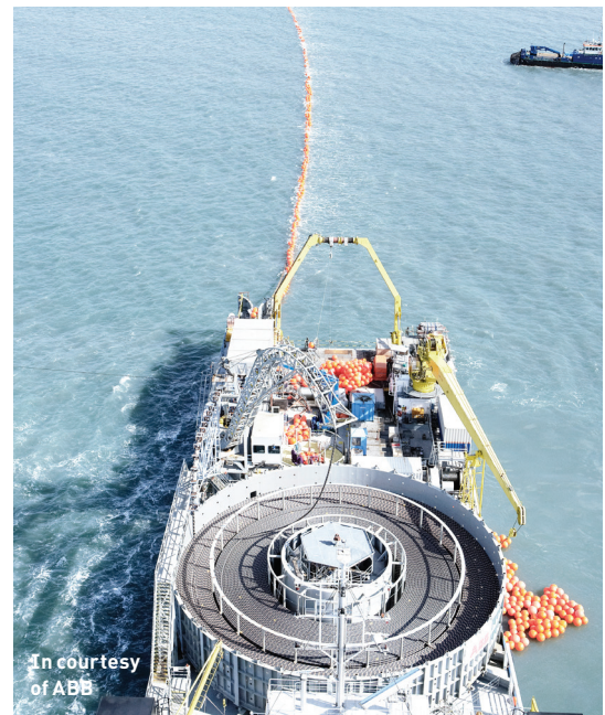
The vessel Topaz Installer is being used to lay down the first 150 kilometres of cable from the Lithuanian coast.

It is important to know that the vessels used in